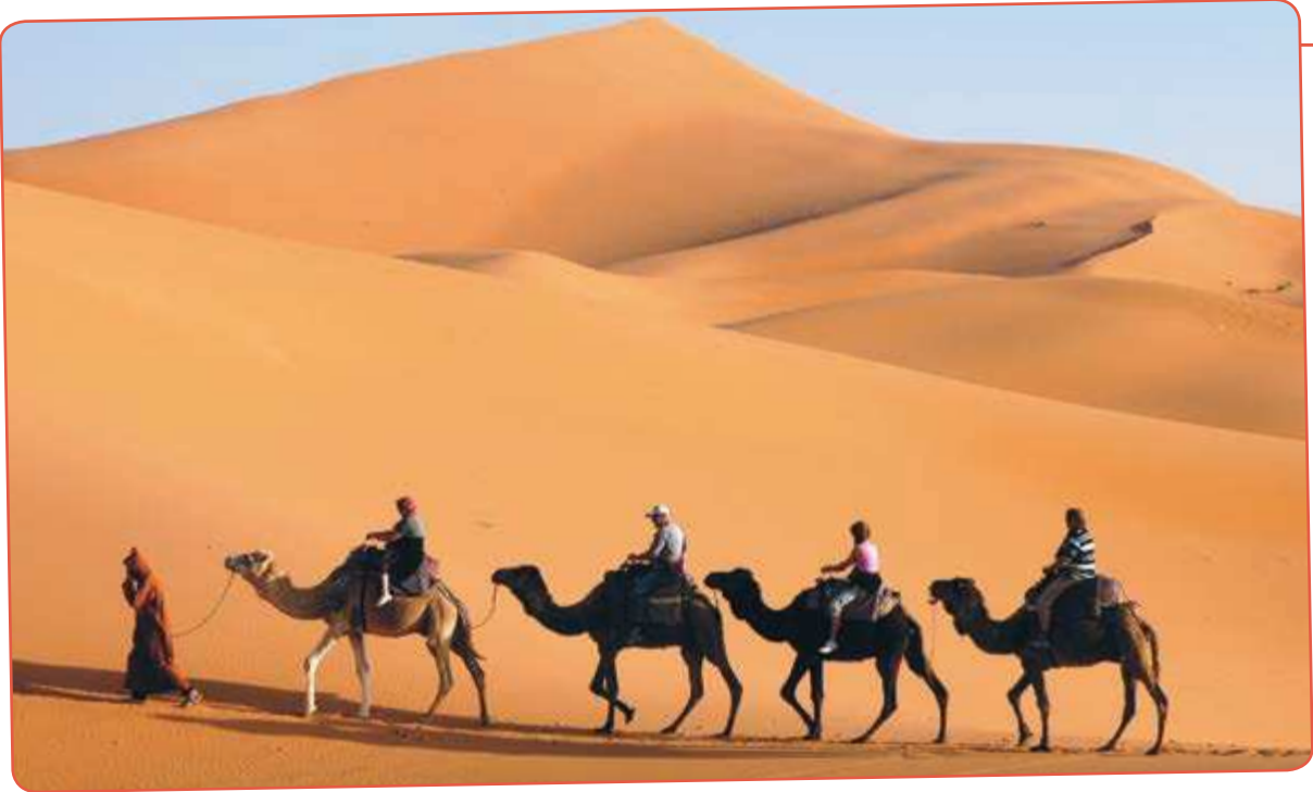
Large areas of the Sahara Desert are covered with sand. This desert is so wide that Germany could fit into it 26 times.